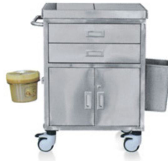
HX-E36 不锈钢治疗车 (柜式)