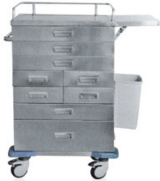
HX-E01 不锈钢麻醉柜 (带灰色塑料桶)