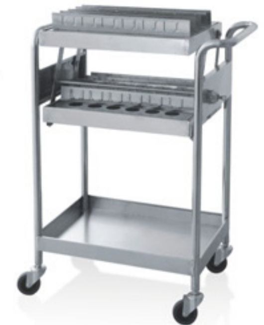
HX-E12 不锈钢送药车 (双层翻斗式)