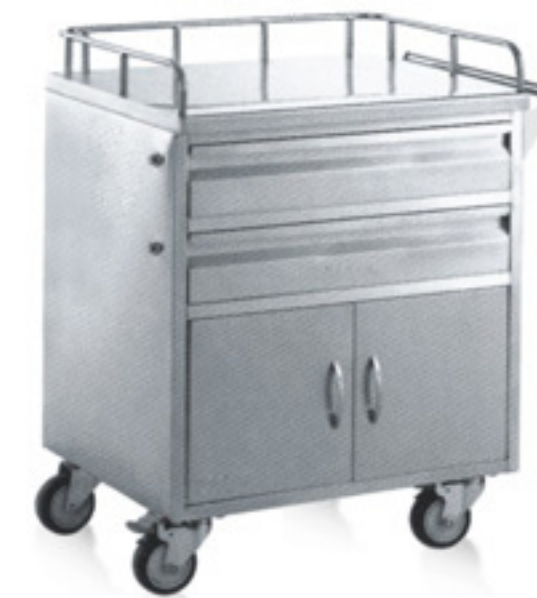
HX-E11 不锈钢送药车 (柜式)

SPECIFICATIONS: (mm) 650×400×835 570×400×920