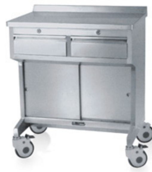
HX-E03 不锈钢麻醉车 (钢琴式)