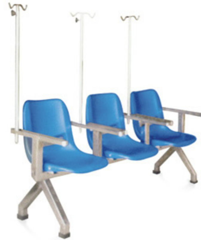
HX-F09 候诊椅 (带输液架)

OPTIONAL: feather sur face of chair with each colour